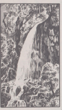
FALLING SPRINGS At the southern entrance to Warm Springs Valley