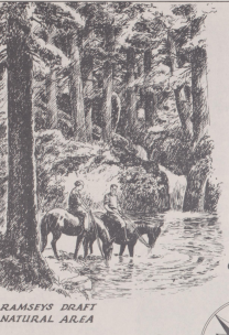
RAMSEY'S DRAFT NATURAL AREA