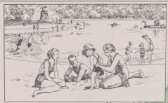
At Shenandoah Lake