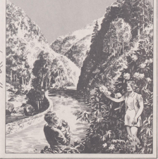
The Maury Highway through Goshen Pass

The Jefferson National Forest adjoins the George Washington National Forest in this area. Adjoining the George Washington on the west is the Monongahela National Forest.