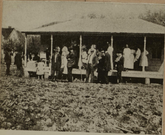
Fig. 1. Trachoma clinic held at Oneida, Ky.