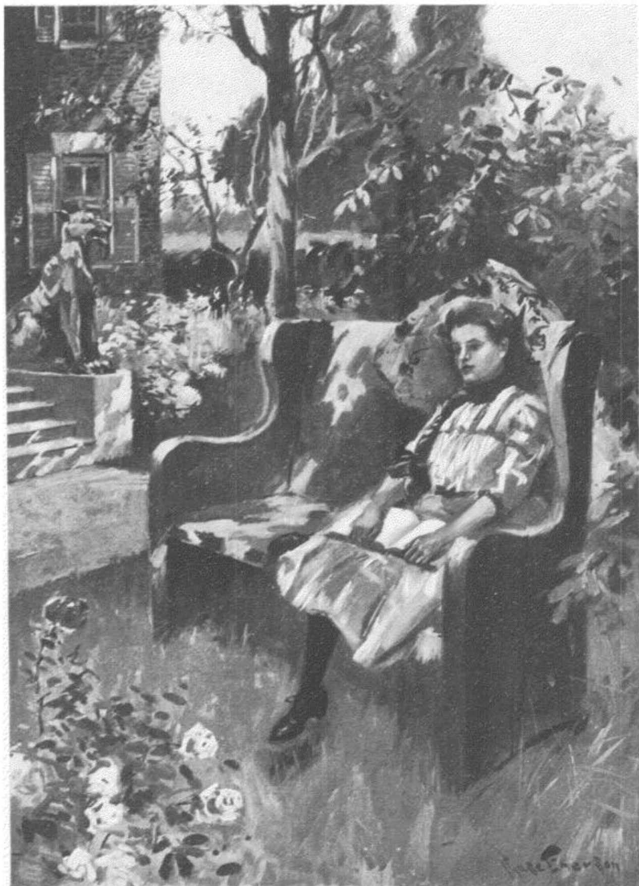
"HOW SWEET THE BREATH BENEATH THE HILL OF SHARON'S LOVELY ROSE."