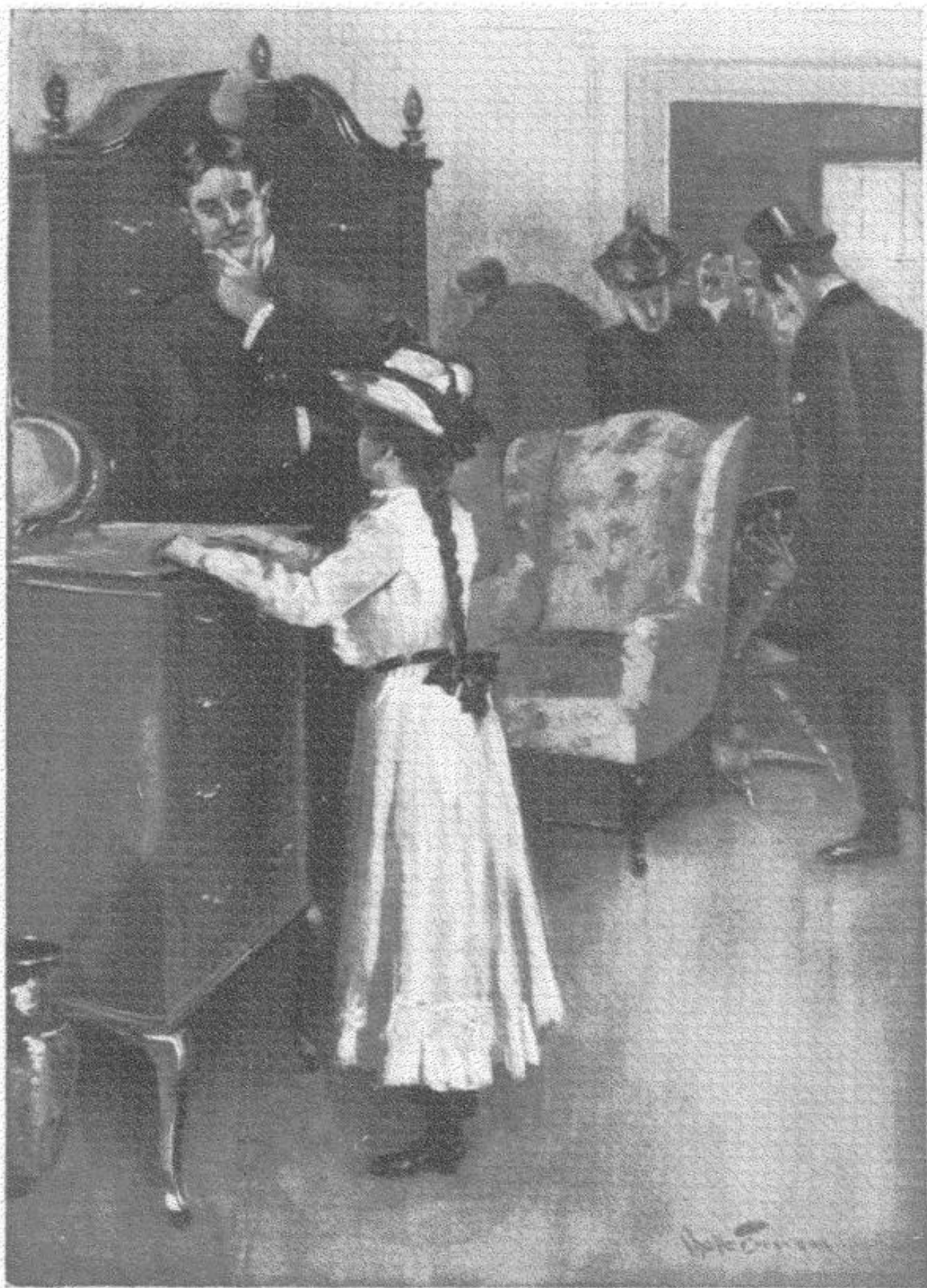
"SHE CHOSE A CHEST OF DRAWERS."