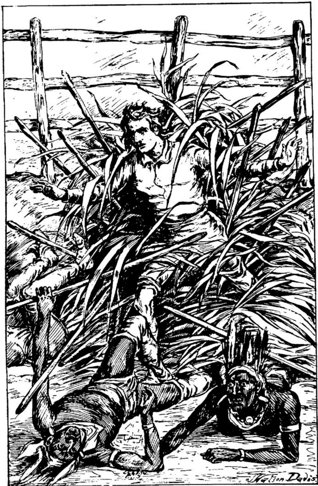
An old stratagem used by Boone to escape the Indians. — Page 156.