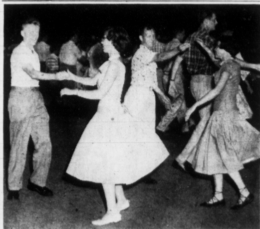
Swing Your Partners!