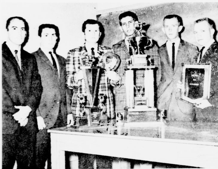
On display in the University Department of Animal Science are the two elaborate gold and silver trophies shown above. The larger was won a few days ago when the UK livestock judging team took over-all team honors at the North Central Collegiate Contest held at the University of Wisconsin. The other was won recently when the Kentuckians copped the team title at the South-

Tickets are one dollar at Kennedy's Book Store or at the door tonight.