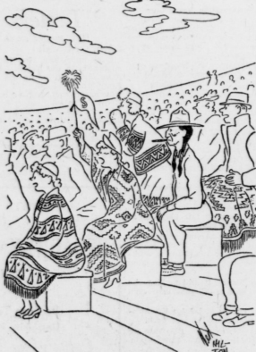
Reprinted from the November, 1947 issue of Esquire.

Advertisement for Becker's shirt laundry services.