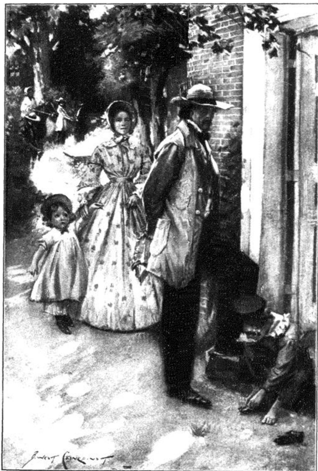
Came in about the time of the second lesson, to hear the sermon.