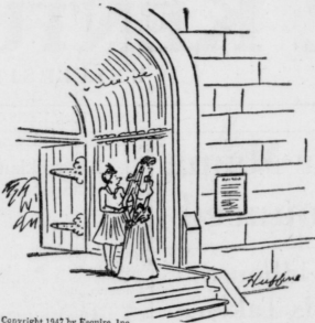
Reprinted from the February 1947 issue of Esquire "Come, dear... don't let him see that you care"