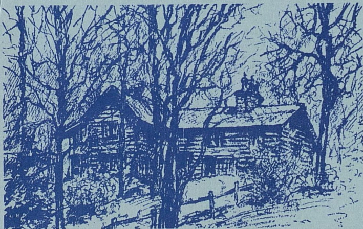
Mary Breckinridge's home at Wendover. Historic Landmark — Restored in 1981.