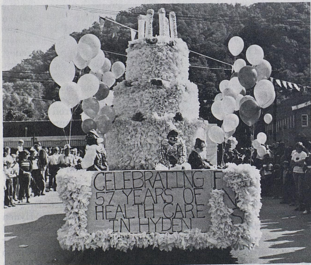
Grand Champion Float.