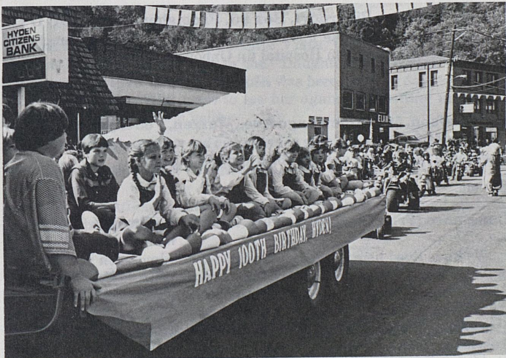
Local children participate in Centennial celebration.