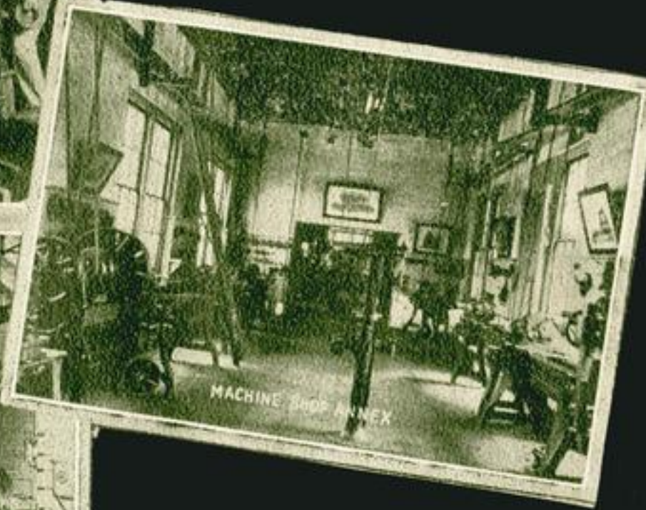
MACHINE SHOP ANNEX