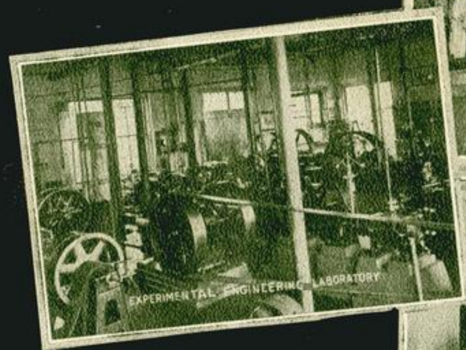
EXPERIMENTAL ENGINEERING LABORATORY