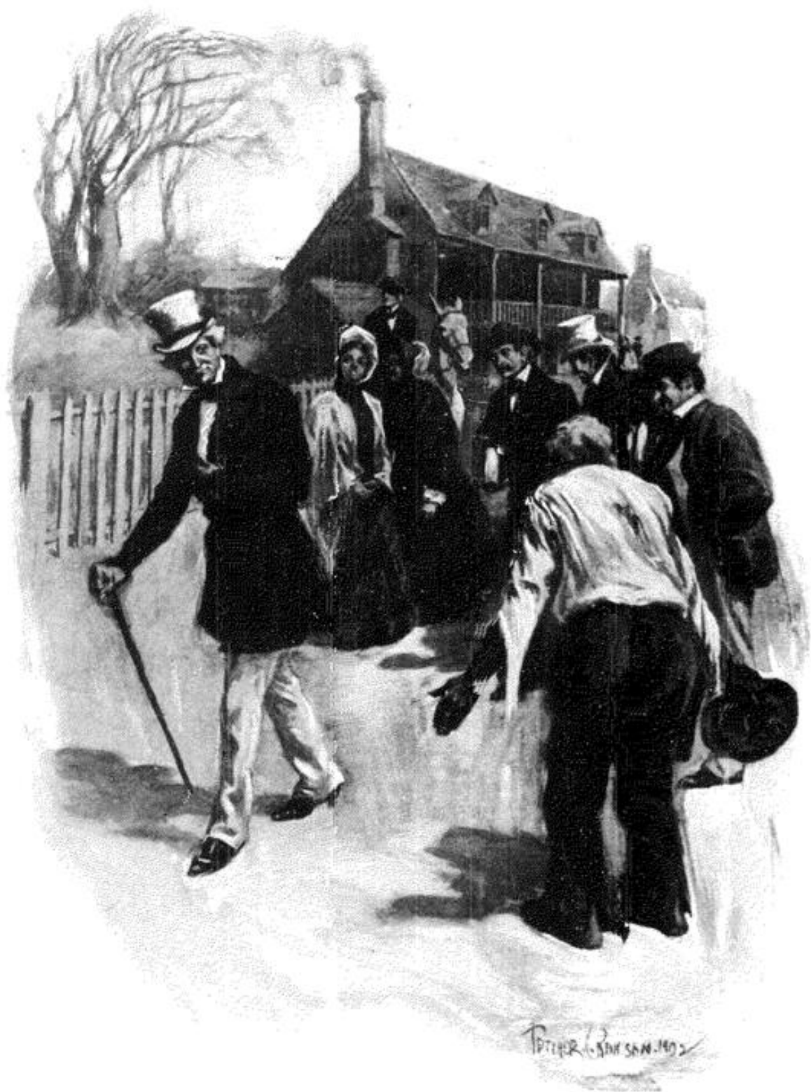
Drew up along the path from the tavern to bow to him.