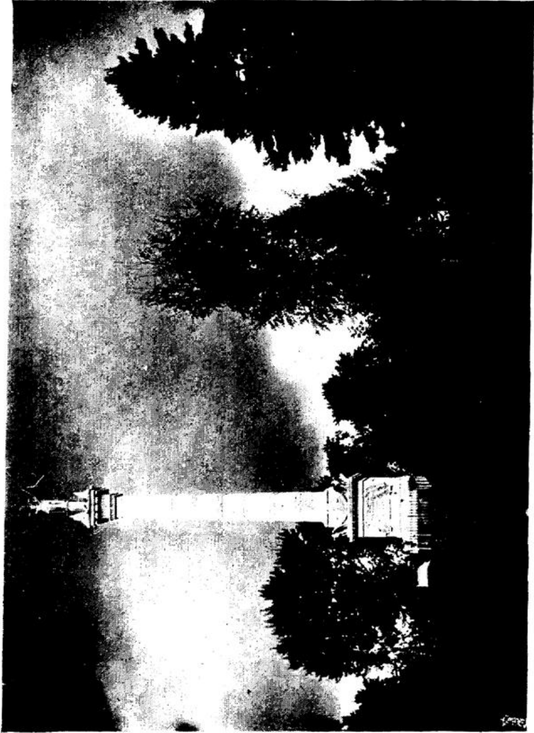
STATE MILITARY MONUMENT AT FRANKFORT, KY. On the soldiers' lot, where O'Hara wrote "The Bivouac of the Dead," and where he is buried.