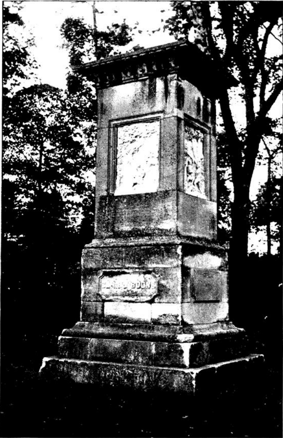
THE BOONE MONUMENT IN THE CEMETERY AT FRANKFORT, KY.