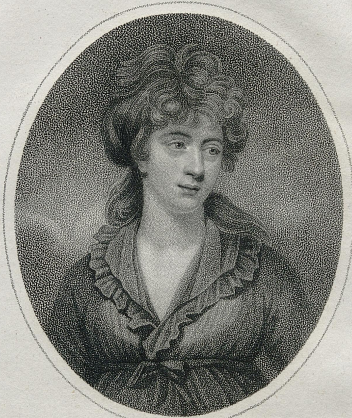
Painted by Opie & Engraved by Ridley