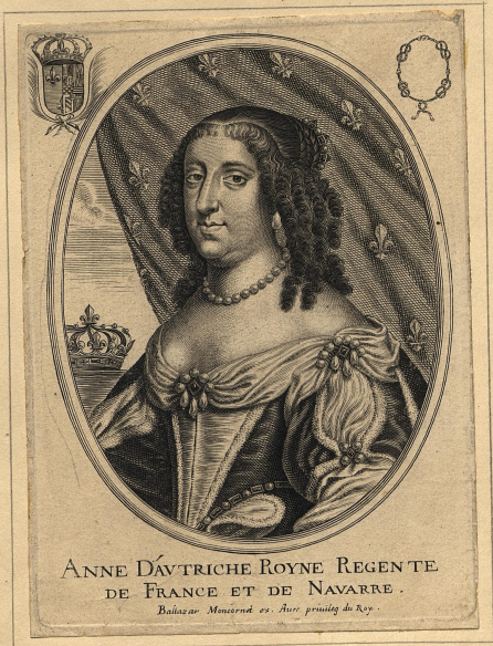
ANNE D'AUTRICHE ROYNE REGENTE DE FRANCE ET DE NAVARRE.