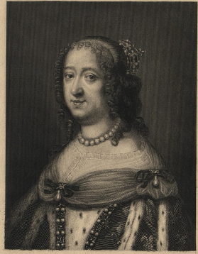
ANNE OF AUSTRIA.

Engraved by H. J. Goussier from a portrait by Philippe de Champaigne.