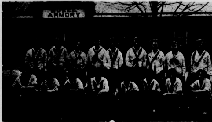
UNIVERSITY OF KENTUCKY GIRLS' RIFLE TEAM.