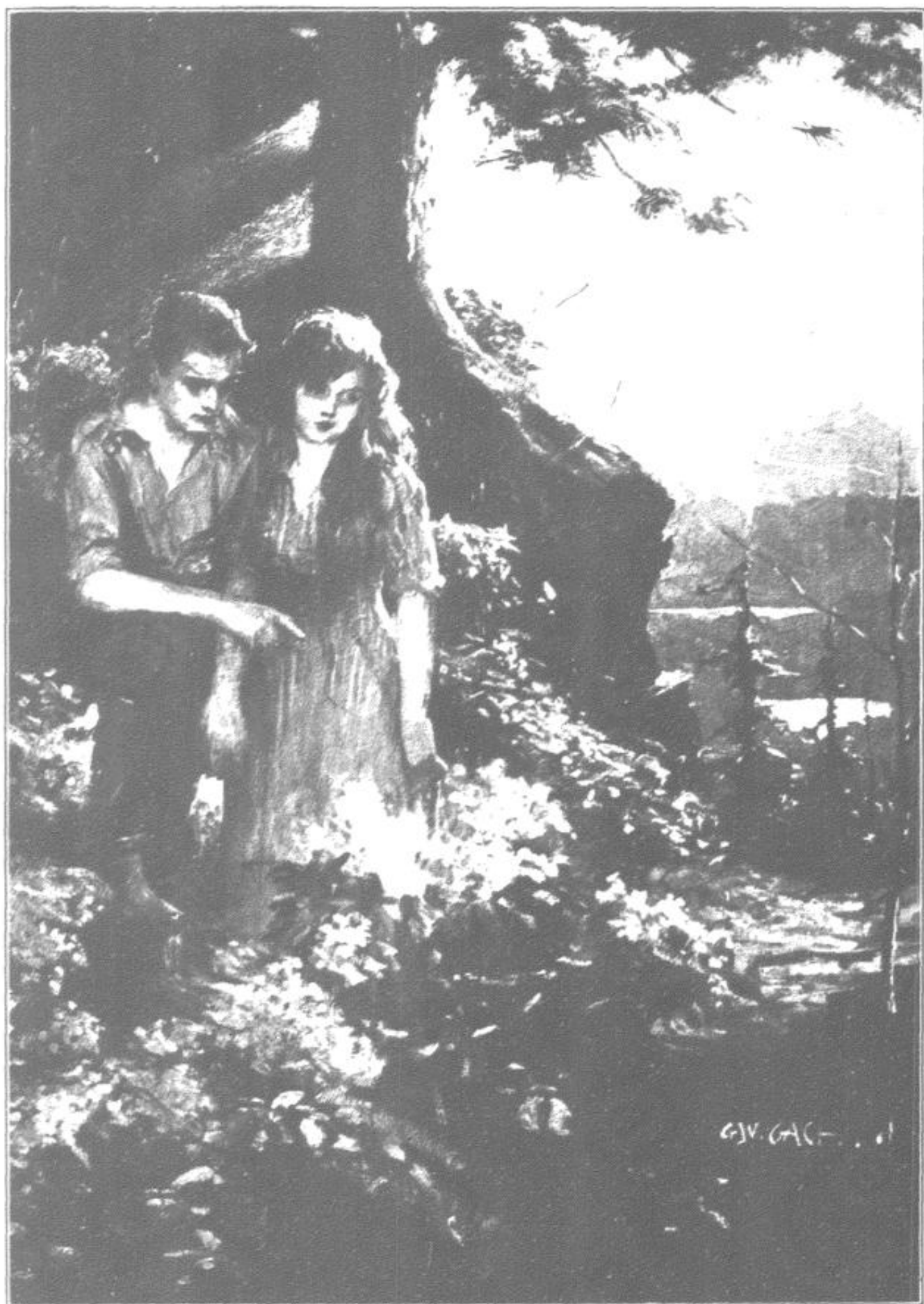
You're agoing to marry me and we're goin' to dwell thar—together