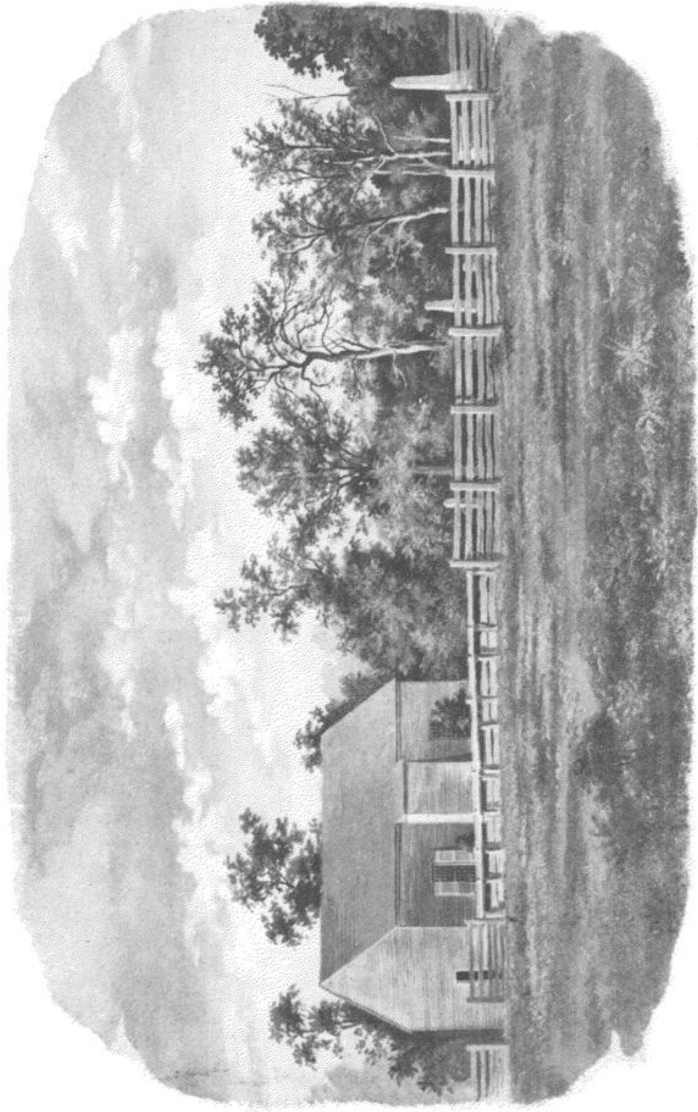
Cane Ridge Meeting-house.