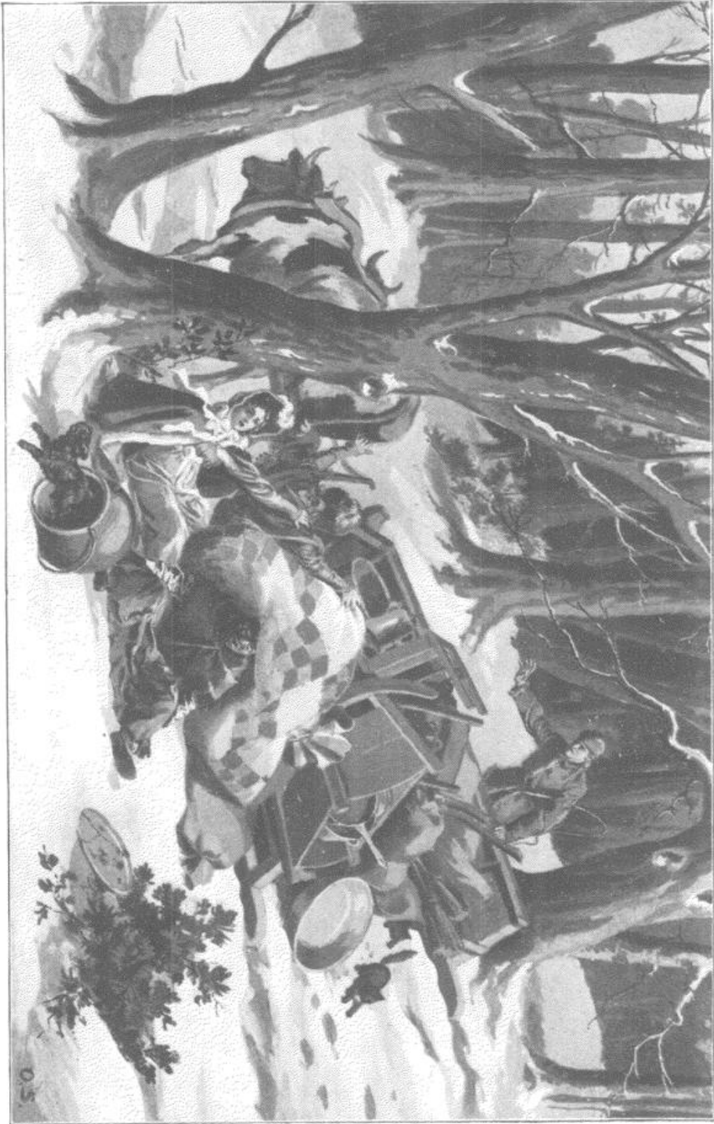
Out tumbled bride, bridesmaid and servant in the snow.