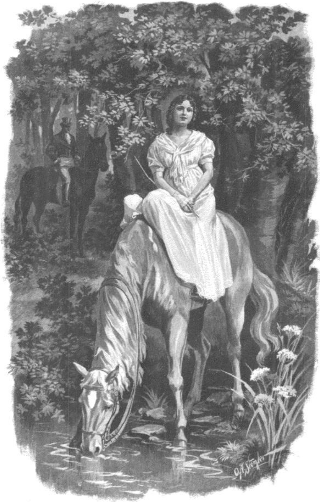
Abner gently checked his mare, and sat watching her.