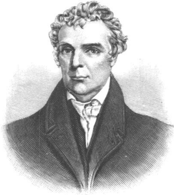
Barton Warren Stone.