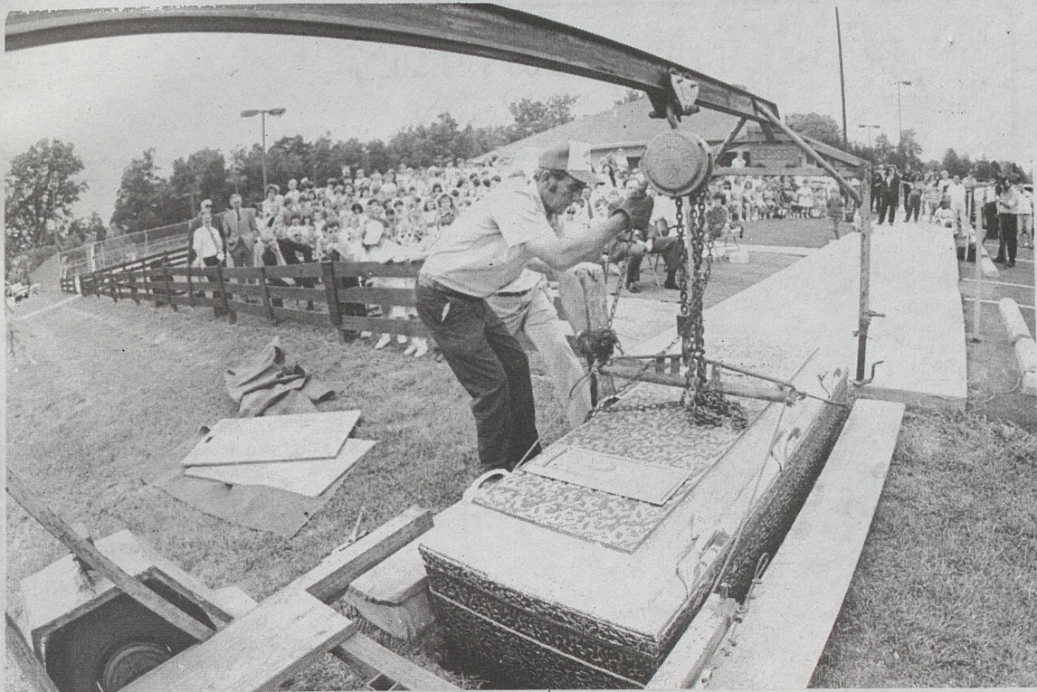
Workers assist with the burial of a time capsule in Taylor County