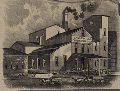
MILL AT NEWBURGH.