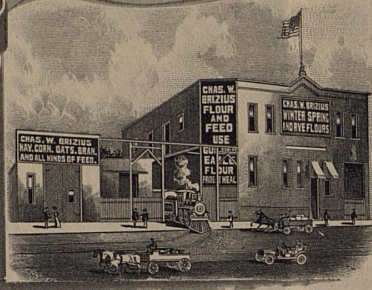
OFFICE & WAREROOMS.

MANUFACTURERS OF WINTER WHEAT AND GRAHAM FLOURS.