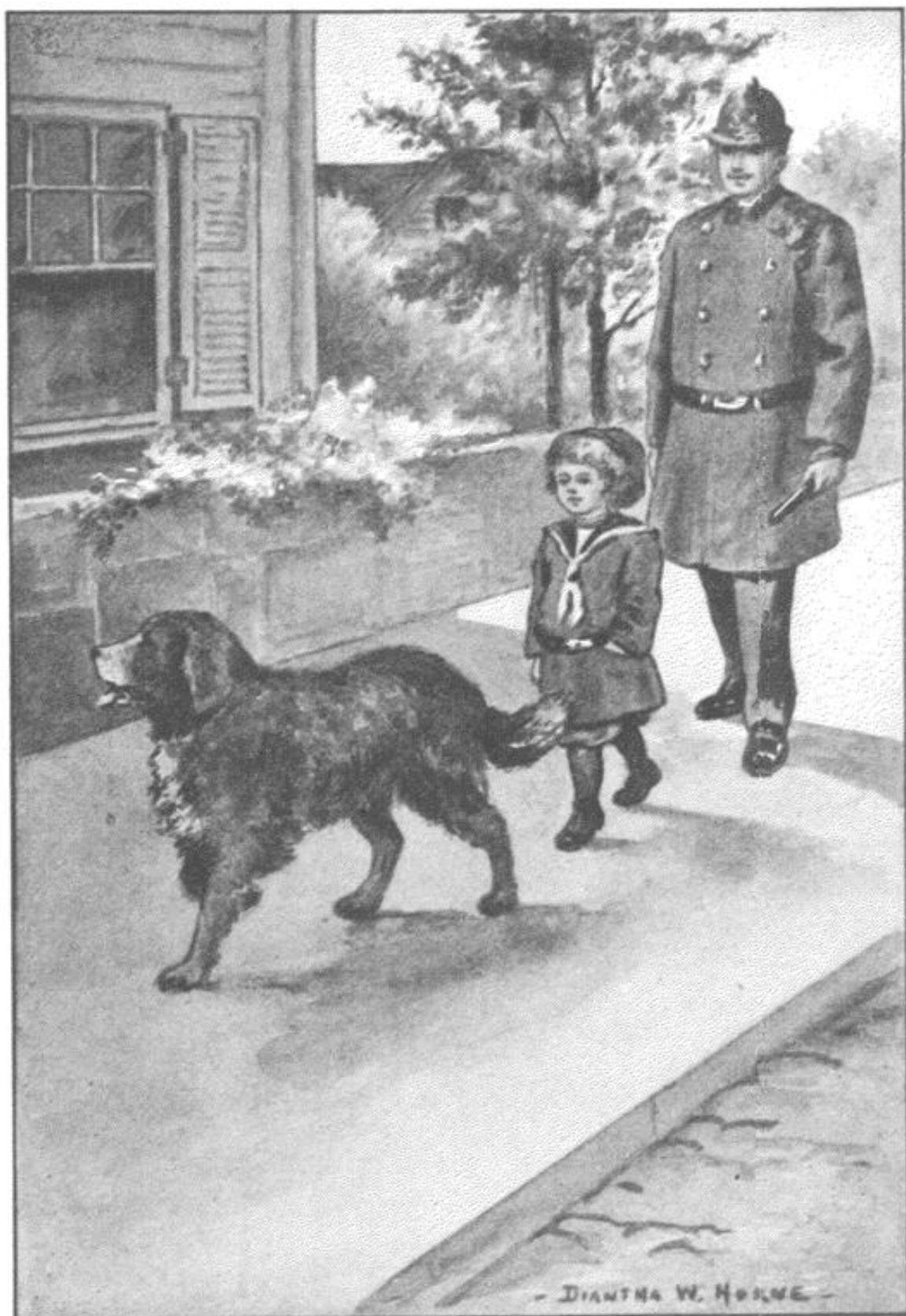
Max wagged his tail and began to trot home—