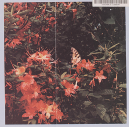
Wildflowers make the forest ever colorful, ever changing. In spring, there are the delicate pinks and whites and in summer the scarlet and yellow blooms. The golds and purples of autumn bring a last burst of color before cold days of winter arrive.

Timber, one of the valuable resources of the Jefferson National Forest, is grown, protected, and harvested under supervision of professional foresters. Forests are managed so that they will produce perpetual yields of high-quality wood products while at the same time providing a home for wildlife, protected watersheds, and a place for outdoor pleasures.