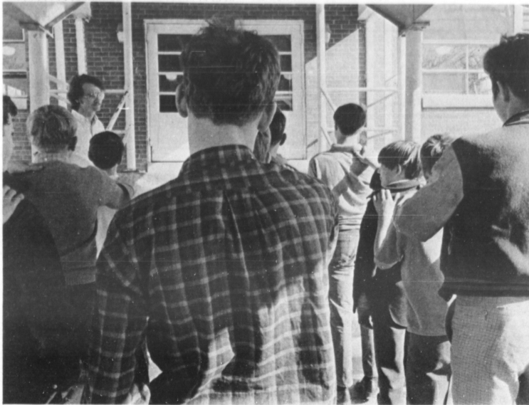
A cottage parent (left) at Kentucky Village Treatment Center lines up his group of teenage boys before they are allowed to enter the cafeteria to eat. Due to the crowded conditions at KV, the juvenile delinquents are often lined up in formation as they go from one building to another, so the cottage parent can keep count of all the boys.

Continued From Page One to say that "little can be done to change the antiquated condition without a major infusion of capital for repairs and remodeling."