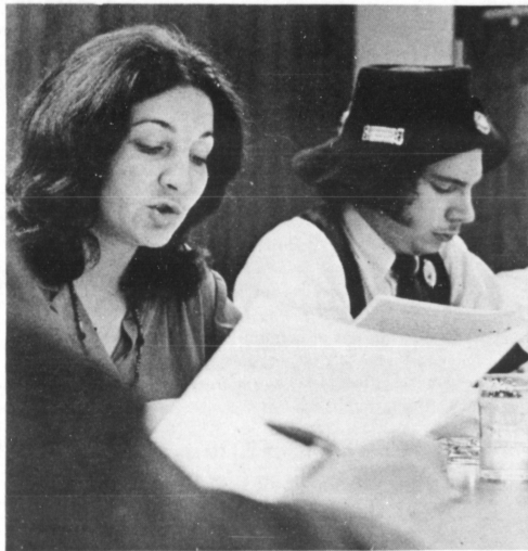
Kernel