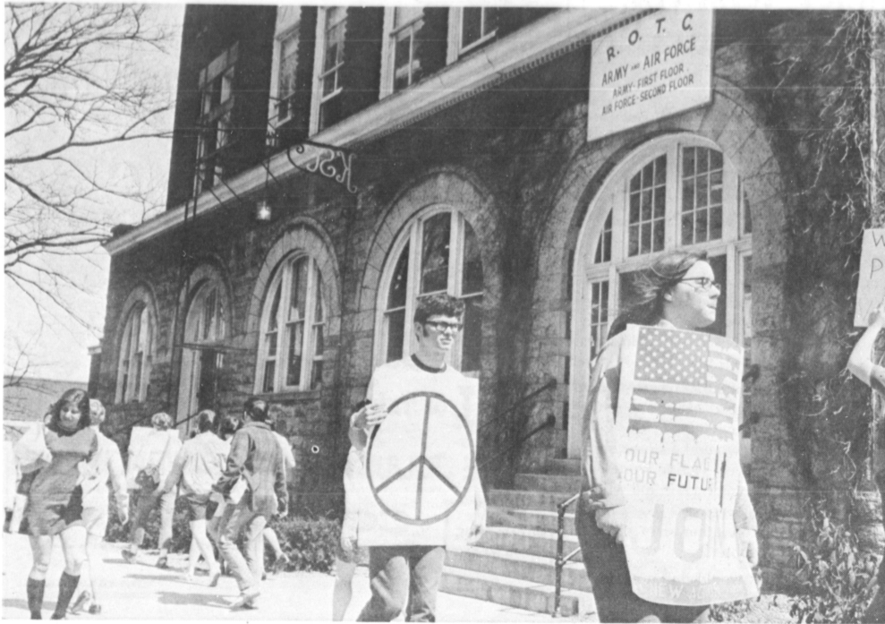
Kernel