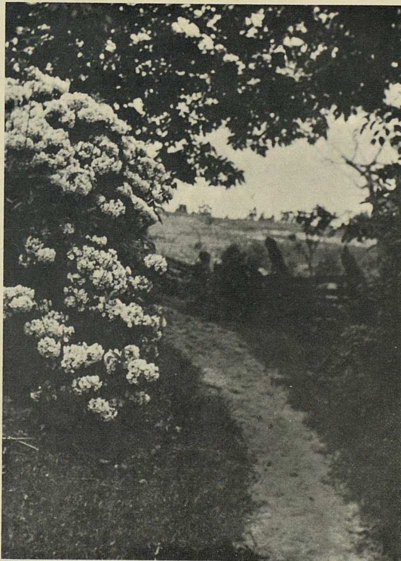
Rhododendron Time In the Kentucky Mountains