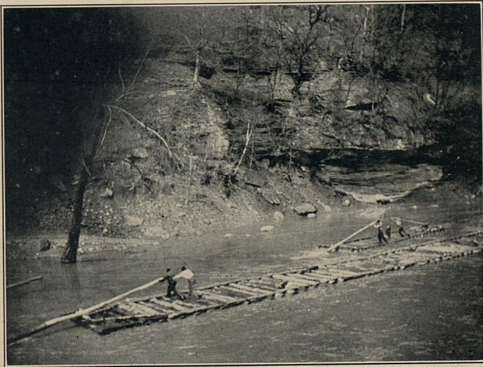
LOGGING ON THE MIDDLE FORK OF THE KENTUCKY RIVER