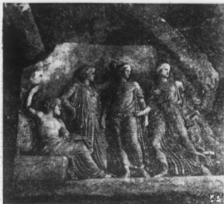
OUT OF THE PAST: A line in a play by Euripides led to the discovery of the ancient temple where this bas-relief was found. It shows, left to right, the god Zeus, his earthy wife Leto, and their offspring, Apollo and Artemis. It probably was carved towards the end of the Fifth Century B. C.