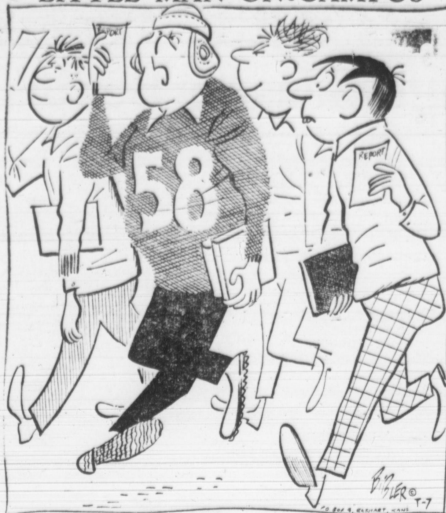
"BOY, I LIKE COLLEGE!— I DIDN'T HAVE TIME TO PLAY FOOTBALL IN HIGH SCHOOL AN' MY GRADES WERE LOUSY."