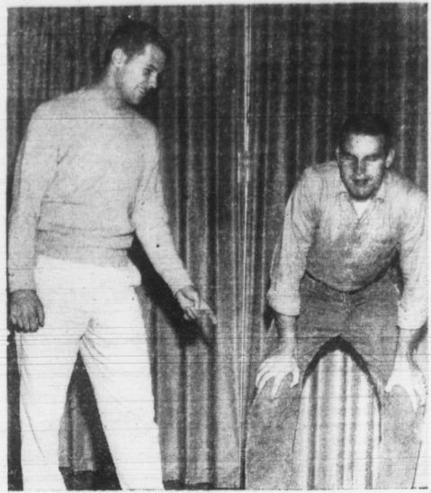
You're Learning Fast, Soph