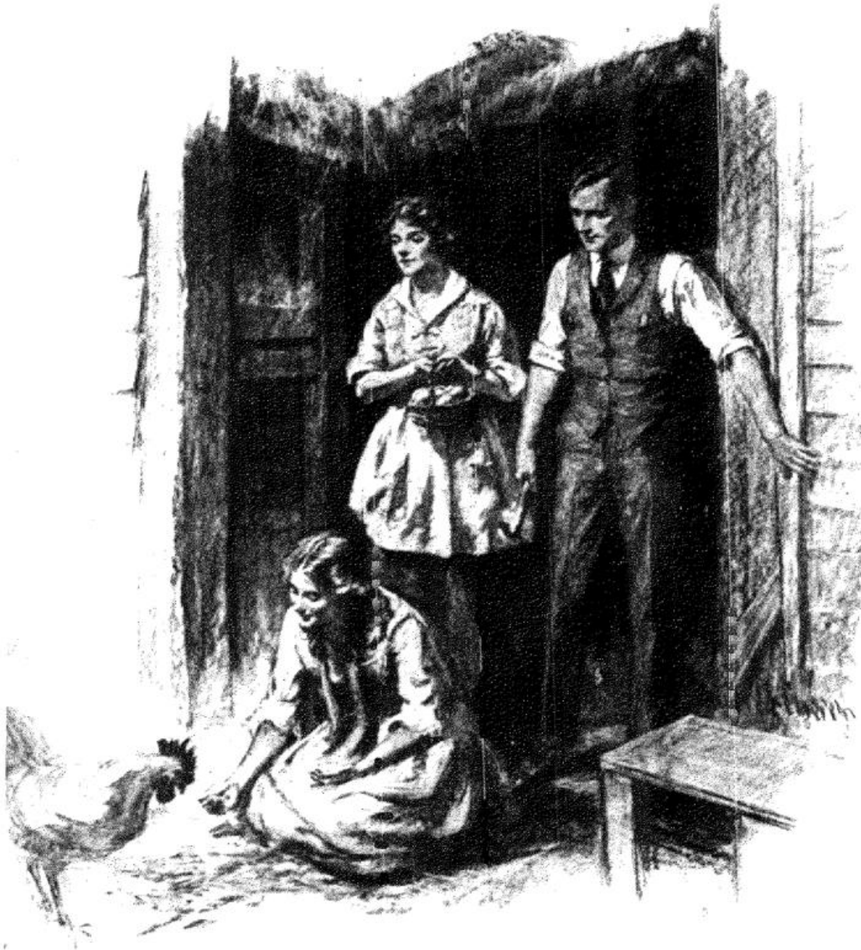
"Oh, how beautiful!" exclaimed Polly, all restraint leaving her young face and body as she fell on her knees before the sultan