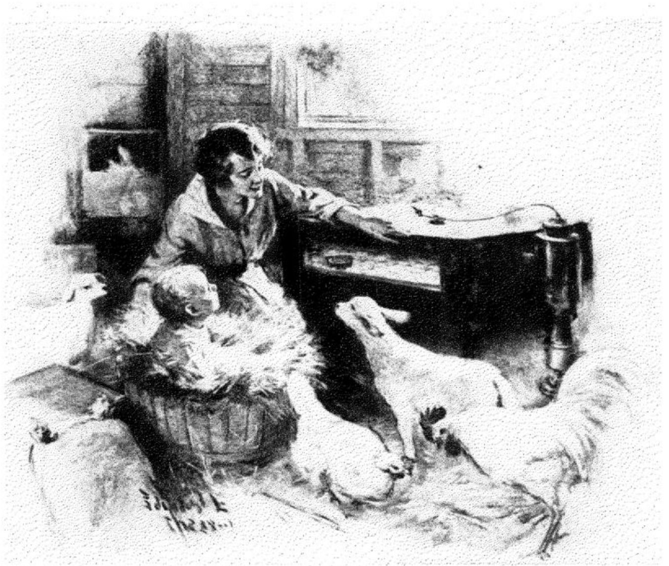
I put his babykins in a big feed-basket and the lamb twins came and welcomed him