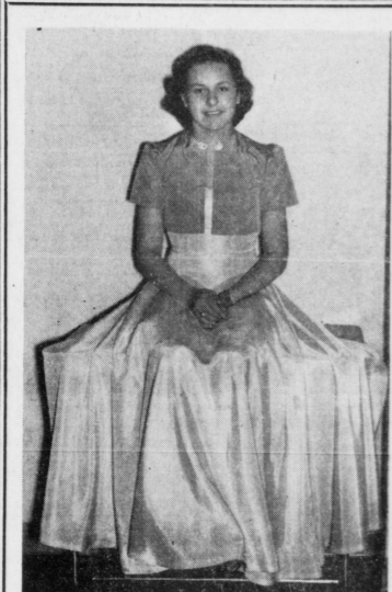
A "Sea of Styles!" ... A "Rainbow of Colors" ... in

It Goes Without Saying: That these play shoes are ideal for campus wear. It is just in the shoe to be comfortable in on warm spring days.