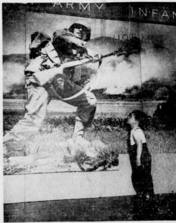
ON EXHIBITION—The U. S. Army Exhibit from the Department of the Army is currently on display in the Barker Hall Armory. Included in the display are scenes showing how wounded men are evacuated from the Korean battlefield and other activities of the Army in combat.

ATO: Your girl is spoiled, isn't she? Dett: No, that's just the perfume she's wearing.