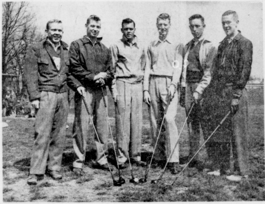
FORE-These men have helped the UK golf squad to one of its most successful seasons in the past few years, finishing with a record of 10 wins, two losses and one tie...