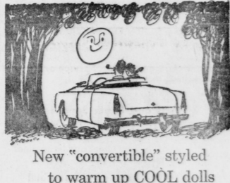
New "convertible" styled to warm up COOL dolls