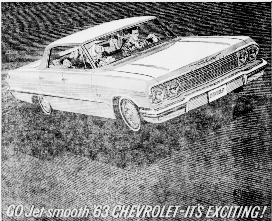
1963 Chevrolet Impala Sport Sedan shares its carefree Jet-smoothness with the new Bel Airs and Biscaynes!

Ask about "Go with the Greats," a special record album of top artists and hits and see four entirely different kinds of cars at your Chevrolet dealer's—'63 Chevrolet, Chevy II, Corvair and Corvette