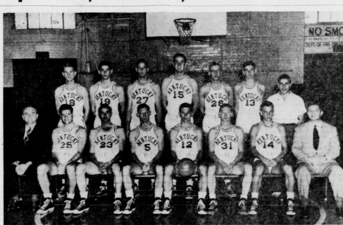
THE NCAA BASKETBALL CHAMPIONS Pictured above is the Kentucky Wildcats basketball squad of the 1948-49 season, which last Saturday climaxed the season by winning the National Collegiate Athletic Association championship at Seattle by beating Oklahoma A & M, 46-36. Acclaimed by many as the greatest college game team of all time, the Wildcats finished the campaign with a record of 22 victories as against only two defeats.