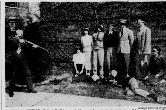
POETIC JUSTICE: Robert P. Tristram Coffin, noted poet who is on campus this week, presents the Kernel staff the award decided appropriate by the recently formed Society for Critical Analysis of Collegiate Journalism. Mr. Coffin had no criticism to make of the paper, other than to suggest a few changes in the staff.

He expressed disgust at the modern trend of poets who complain that they cannot understand things about them, and say nothing constructive. "I'm tired of poets who say, 'Ladies and gentlemen, I'm confused,'" he concluded.