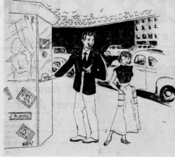
"About this date tonight, Johnny — April Fool!"

MEMBER— Kentucky Intercollegiate Press Association Lexington Board of Commerce Kentucky Press Association National Editorial Association Representative for National Advertising by National Advertising Service, Inc. College Publishers Representatives 420 Madison Ave., New York 17, N. Y. Chicago - Boston - Los Angeles - San Francisco $1.50 per semester