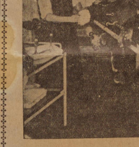
Improved Modern Method of Operating Upon a Horse.