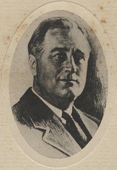
FRANKLIN D. ROOSEVELT