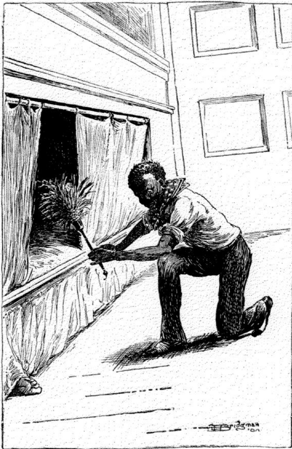
DAVE FINDS MULGRUM UNDER THE BERTH.