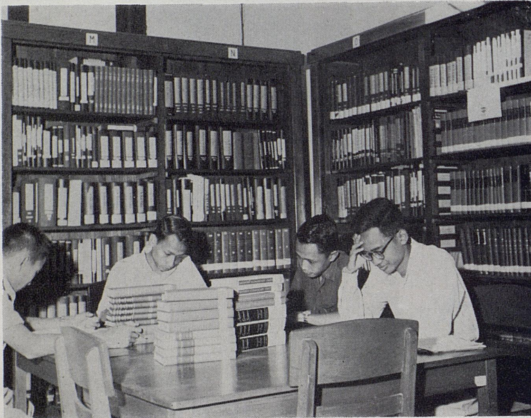
Students study in the Physics department library at Bandung. Reference books ordered by UK are now in use in the University libraries.

It may be years before the professors may hope to see the fruit of their labors, but they continue with the certain knowledge that their accomplishments will multiply as the years pass. Indonesia, unlike many of the newly-