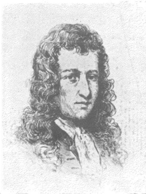
RENE-ROBERT CAVALIER, SIEUR DE LA SALLE.

The Discoverer of the Site of Louisville.