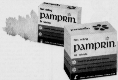
PAMPRIN . . . products for a woman's world

Maxson's Heed the voice of the Spring Turtle