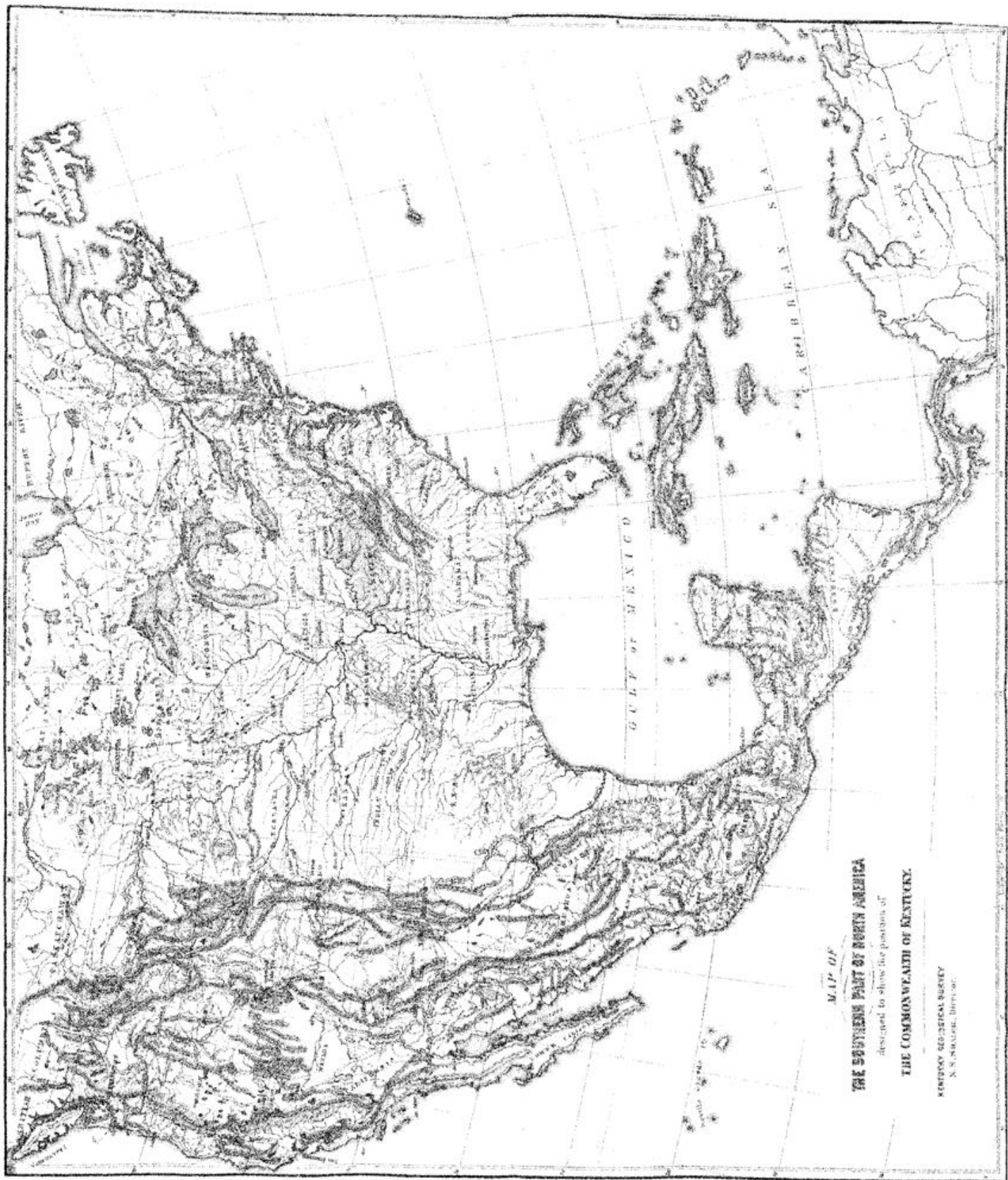
MAP OF THE SOUTHERN PART OF NORTH AMERICA designed to show the position of THE COMMONWEALTH OF KENTUCKY.

KENTUCKY GEOLOGICAL SURVEY U.S. NAUTICAL BUREAU