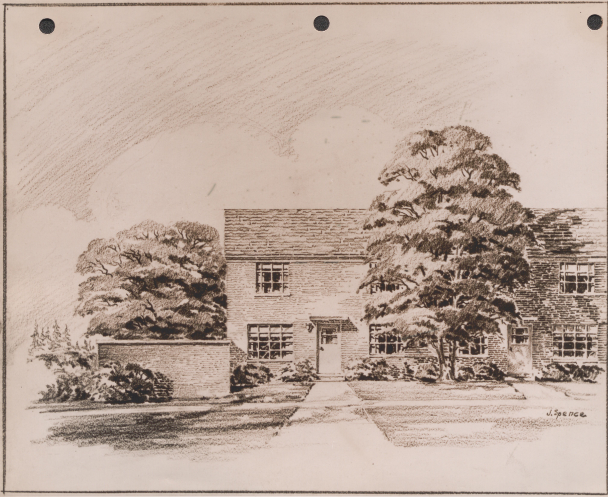
EXHIBIT A 17