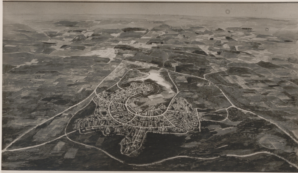
GREENBELT MARYLAND RESETTLEMENT ADMINISTRATION DIVISION OF SUBURBAN RESETTLEMENT