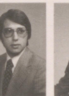
WILLIAM G. BARR II