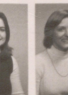
ROSEMARY F. CENTER