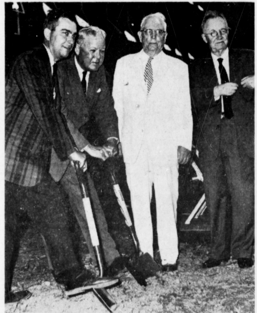
Groundbreaking For Library Addition

The state has appropriated two million dollars which will finance about half of the main building. The first half will be so constructed that it can be fully utilized before the rest of the center is completed.