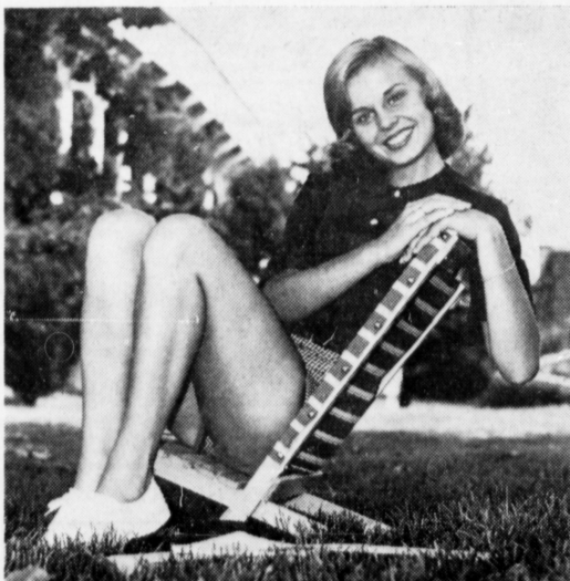
One More Week