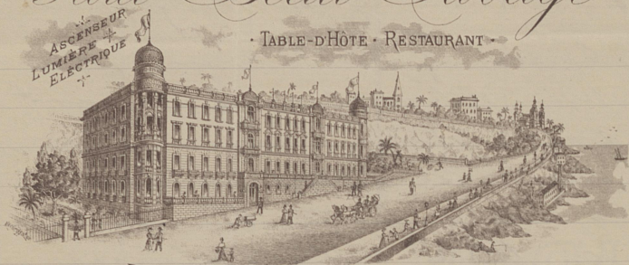
TABLE-D'HÔTE · RESTAURANT