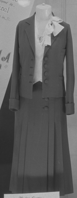
Ridge Cross inspiring the great set