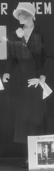
My old costume by June Renault